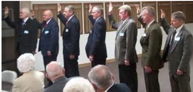
New SUP National Officers sworn in.