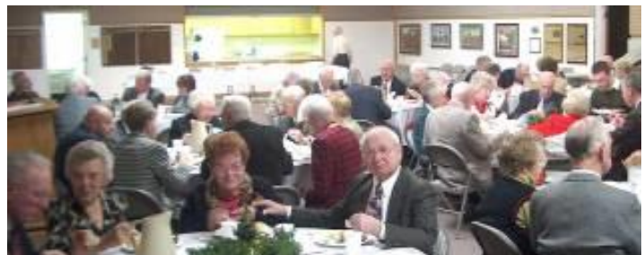
National Christmas Dinner Meeting

The Annual Sons of Utah Pioneers National Christmas Dinner was held on December 11, 2007 in the Heritage Room of the National Building. Over 75 national board members, program directors, and past presidents met with their spouses to enjoy an evening of good food, music presented by a group from Mountain Jubilee Chorus , and the swearing in of our new