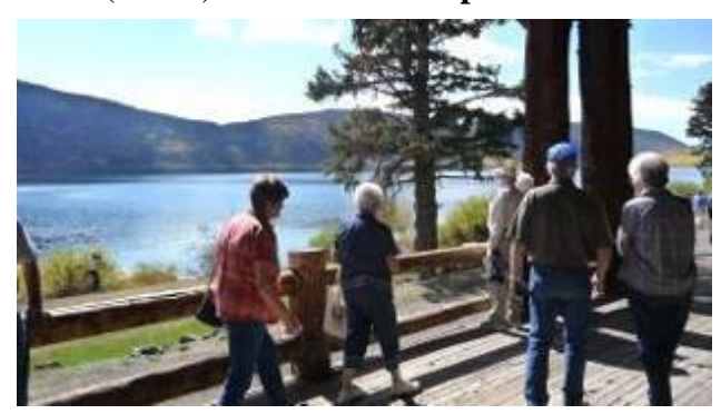
National Monument (below). Local members