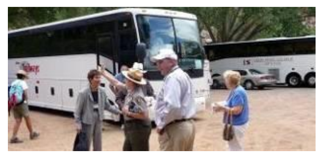
Building. Three busses (above) traveled to Fish Lake (below) and on to the Capitol Reef

Park, west to Cove Fort and further North to Fillmore, Utah with its Provisional State Capitol