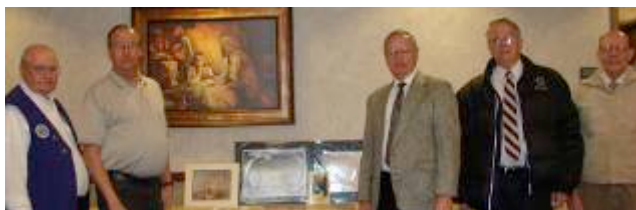
Idaho Training – Upper Snake River Chapter

We feel that this training is especially important to new board members who are learning their duties. A well-functioning board led by an enthusiastic chapter president is essential for chapter success. The Executive Council encourages chapter presidents to share the training ideas with board members who were unable to attend the training meeting, and to follow-up on the items presented in subsequent meetings.