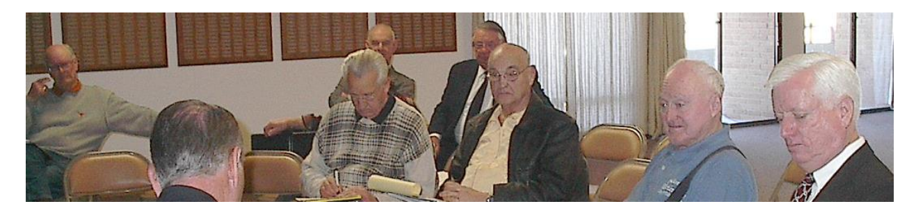
Areas 4 & 6 breakout