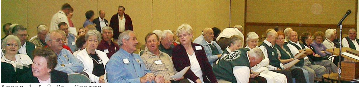
Areas 1 & 2 St. George