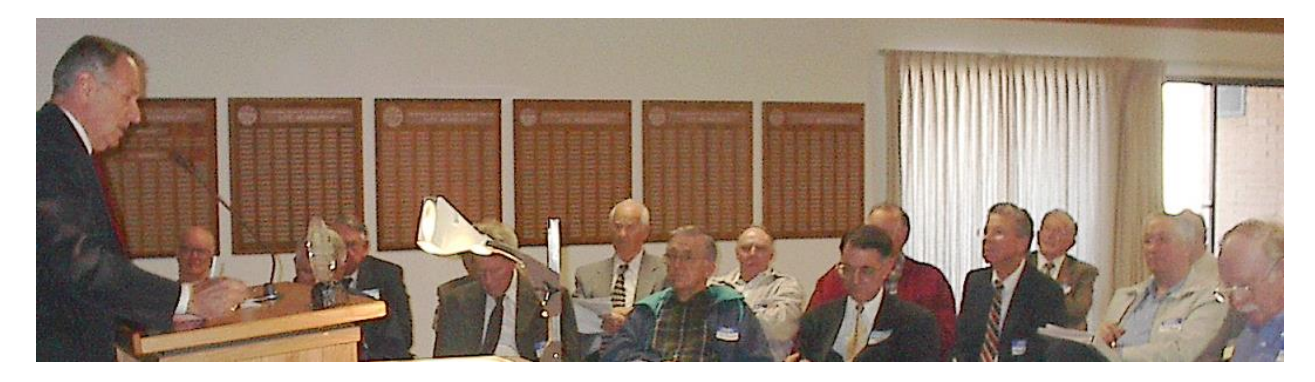
Areas 4 & 6 Barton