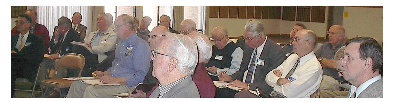
5 & 7 Salt Lake and Davis Counties