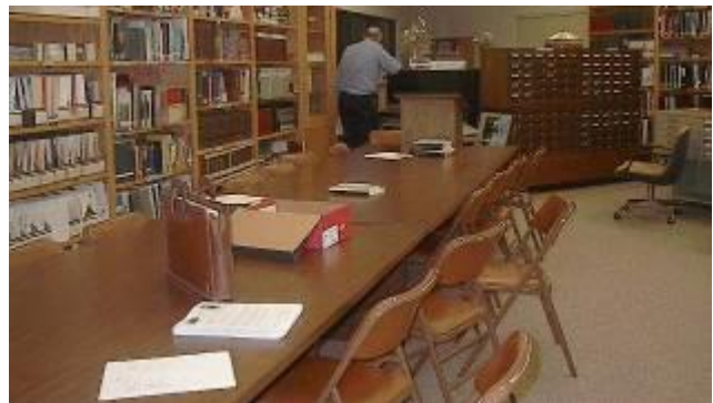
New Library carpet and rearranged National Board Conference Table.

offices received new coats of paint and brand new carpeting . We hope all members will plan a trip sometime during the 2008 year to visit “their” building.