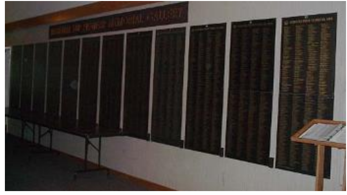
valleys before Utah became a state. A picture of these memorialization boards is included (above)

One of the ongoing pioneer heritage programs National is emphasizing this year is the Pioneer Memorialization program. Many Chapter members have not seen the boards and plaques honoring the pioneers who settled the mountain