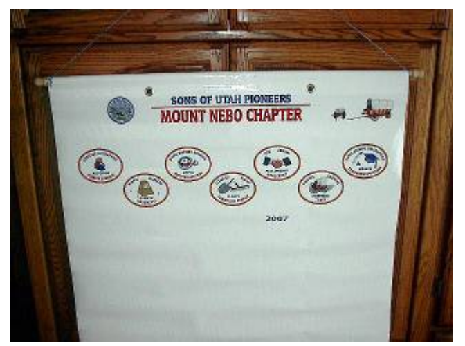
Nebo Chapter Banner

meetings where they can be displayed. This represents the first chapter awards given under the new Awards program initiated at the Heber City Convention in 2006, and covered the period from July 1, 2006 to December 31, 2007. Minimum standards have been identified for 2008, and chapters are asked to submit quarterly reports to help determine award recipients. Annual award recognition will be made at each April Chapter Presidents Council meeting.