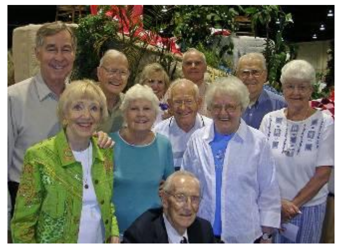
Past national presidents and wives judging the float to be presented the Sons of Utah Pioneers Award

depicted the values (integrity, family loyalty, faith in God, etc.) for which the pioneers lived and sometimes died.