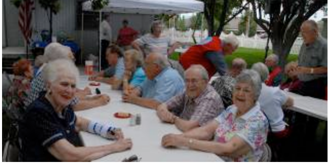
This location has been a favorite with members because they can visit the many artifacts and

JORDAN RIVER TEMPLE (Southwest Salt Lake Valley, Utah) The annual summer picnic (below) was held at the West Jordan Museum