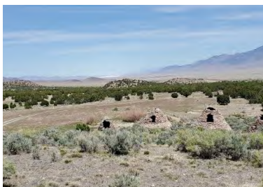
5 Kiln Site from Behind