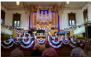
Sunrise Service at the Assembly Hall