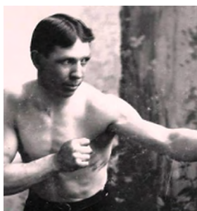
The Fighting Preacher