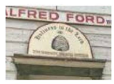
Food Store in Wallsburg