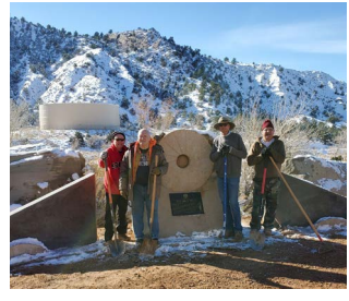
Old Grist Mill Monument

Over the last couple of months our monument committee has been busy with both a new monument and improvements to an existing monument. A new monument was erected in Newcastle, Utah, marking the route of the Old Spanish Trail through the area. Improvements were made to the Old Grist Mill monument at the mouth of Cedar Canyon to enhance its appearance and protect it.