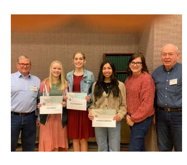
Pioneer Heritage Essay Contest Winners

The Morgan chapter of the Sons of the Utah Pioneers gathered last Monday for their monthly luncheon. A delicious smoked brisket and baked beans meal was provided by Birt's barbeque from here in Morgan. Three Morgan High School students were in attendance with their parents to receive cash awards for this year's annual Pioneer Heritage essay contest. Participants submit