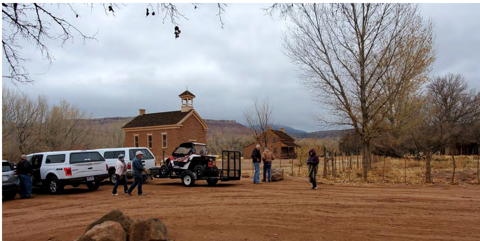
Grafton Ghost Town