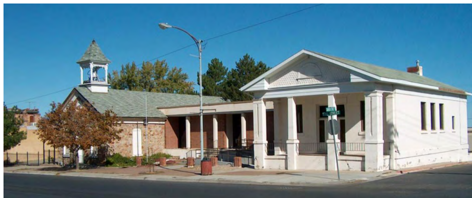
Tooele Pioneer Museum

Our first virtual Dinner (non-dinner) education meeting was about the tremendous effort of restoring the outside of the museum to its Carnegie Library status, and doing lots of