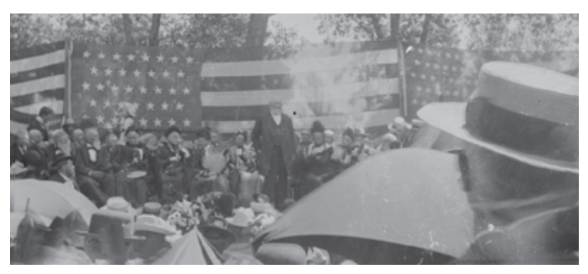
The Original Dedication of Pioneer Park. This photo of President Woodruff was the last known photograph of him in a public setting. The following month he departed for San Francisco and passed away that September.