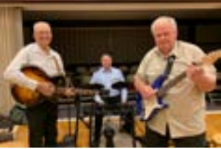
Hansen Bros Band