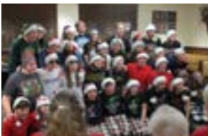
Taylorsville HS Madrigals

The Taylorsville/Bennion chapter had a wonderful chapter meeting in December. We were blessed with the opportunity to listen to the Taylorsville High School Madrigal Choir. They performed a selection of Christmas songs that was a delight to listen to. We had a good showing from Chapter members and even had a couple of new members there to enjoy the evening. This Chapter meeting is always a highlight of our year. We are always thrilled to be able to meet with our Chapter members and enjoy a wonderful dinner and