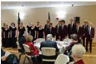
Pine View HS Choir

The Cotton Mission Chapter enjoyed a nice Christmas dinner catered by the Golden Corral Restaurant, followed by a wonderful program. The Pine View High School Chamber Choir gave us an excellent presentation of choir numbers arranged in a tightly harmonized fashion. We appreciate their planning since last February for this