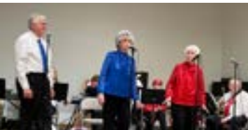
M and M Band

The Mountain Valley Chapter held their monthly Chapter meeting on 21, December 2022. The chapter had a musical Christmas Program given by the M & M Band of Heber Valley. The event was open to the public. Fun was had by all.