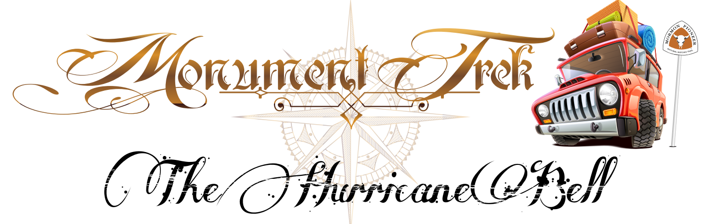
Hurricane Town Square, Hurricane, Utah - SUP #280

At the turn of the 20th century the Hurricane Bell was first hung from a hay derrick near the northeast corner of the town square (State and Main Streets). When the Social Hall was constructed next to the bowery in 1908, the bell was removed from the bowery location and mounted over the front door of the Social Hall. The bell remained there until a school was built in 1918 at 50 South Main Street where the bell remained until it was moved to the Red Brick Church (The old South Ward Chapel located at 300 South and 100 West).