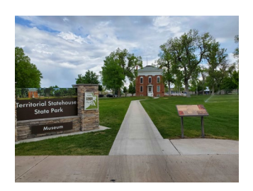
Fillmore Statehouse Museum