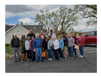
Group at Cove Fort

On Saturday, May 13, 2023, our chapter took an all-day trek to the Utah Territorial Statehouse Museum in Fillmore with stops on the return trip to Cove Fort and Beaver. The Utah Territorial Statehouse Museum was once the capital building for the Utah Territory. The site was selected, and construction was initiated at the request of Brigham Young, the governor of the Utah Territory at the time. It was selected because it was at the very center of what was then the State of Deseret and had ample water and materials to support a community. Designed by Truman Angell, only the first of four wings was completed between 1851 and 1855, and it only served a short time as the territorial capital and site of annual legislative sessions. It is now a state museum