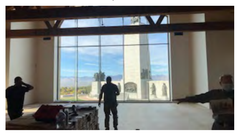
View out new Visitor's Center window