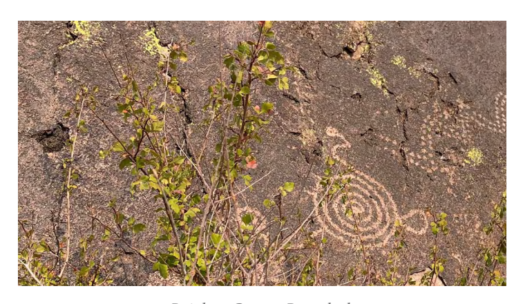
Rainbow Canyon Petroglyph

The trek was led by Al Matheson. The group was relatively small (12 people in 7 cars) in order to meet state requirements during the pandemic which we believe were successful in keeping the group safe while still providing a great activity that was shared with all chapter members in our latest newsletter.