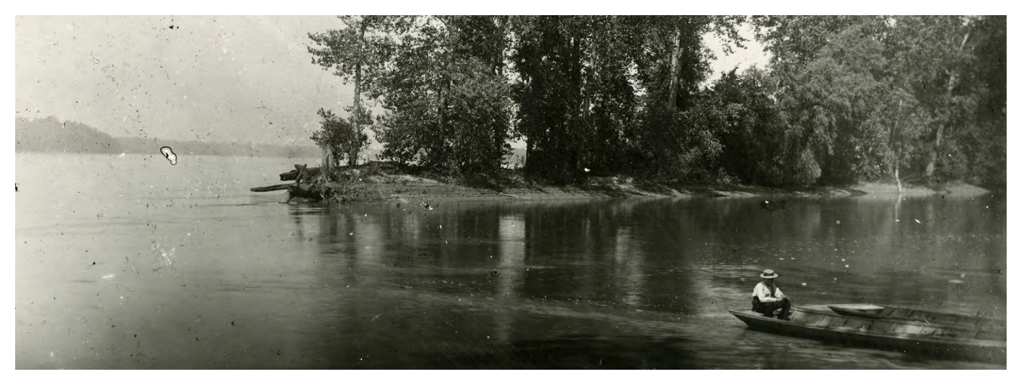
Fishing River, Clay County, Missouri