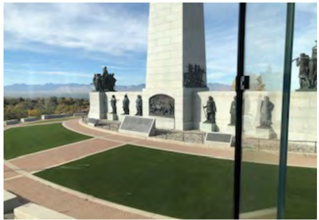
This Is The Place Monument from Visitor's Center