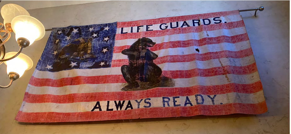
(Continued From Previous Page)

to be open in the spring. This would make a great trek for chapters.