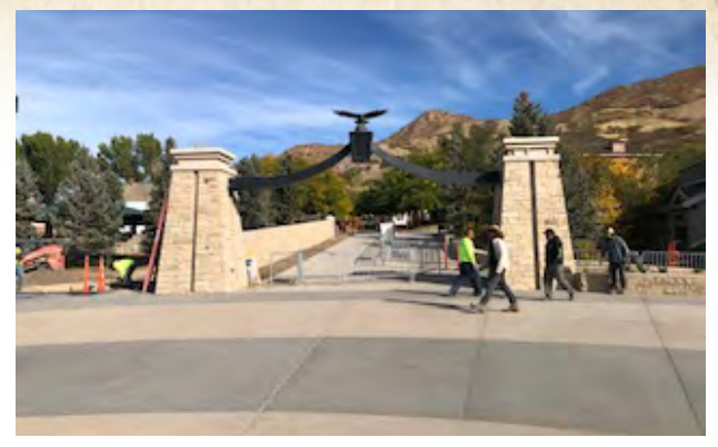
New Eagle Gate